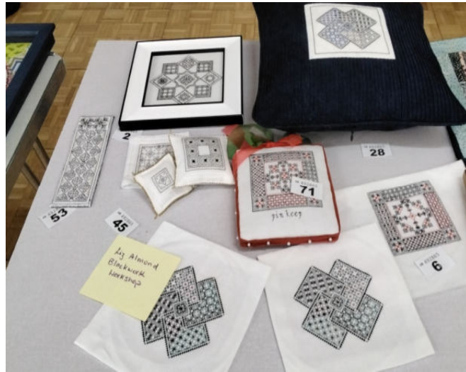
Examples of work undertaken by members who attended my workshops